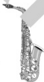
Alto Saxophone (中音萨克斯管)