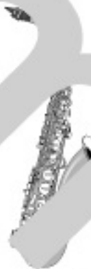
Tenor Saxophone (次中音萨克斯管)