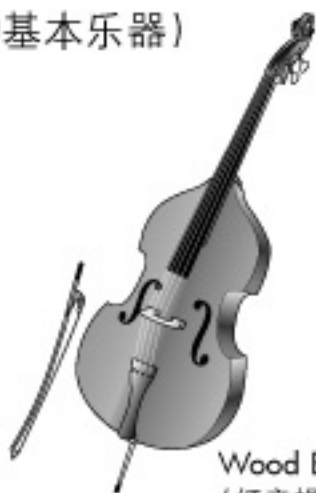
Wood Bass (低音提琴)