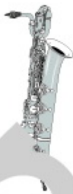
Baritone Saxophone (低音萨克斯管)